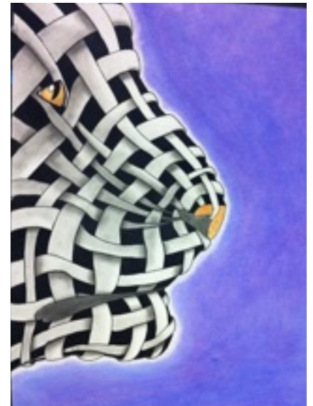
Wrapped Animal Examples